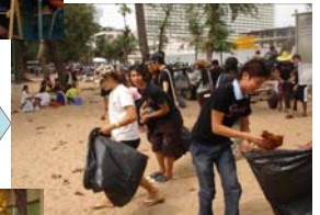
Social service activity conducted by sex workers