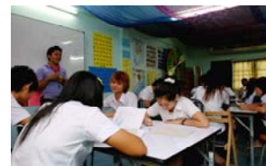
A non-formal education class for sex workers