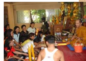
SWING members attending Buddhist ceremony