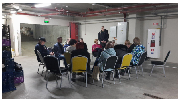
Working meeting of consultants on monitoring the availability and quality of HIV services, December 14, 2023