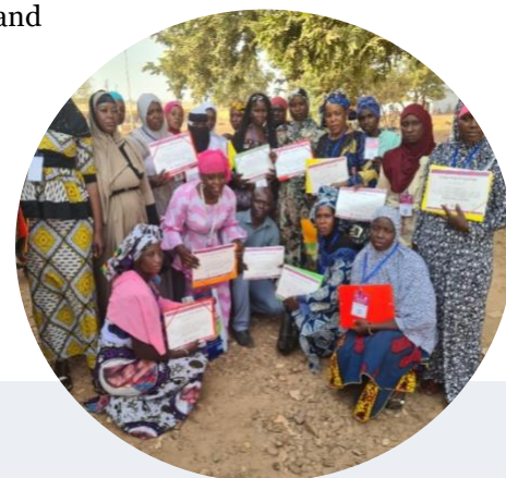
Women miners in Mali's Cercle de Kenieba who completed a training by Pact.